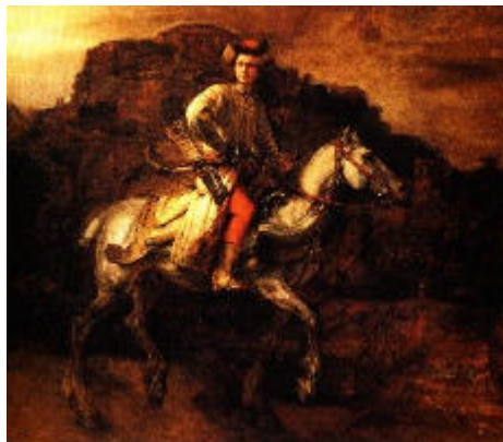
The Polish Rider ( Painting by Rembrandt, 1655) A tradition states that this is a portrait of the mysterious Rosicrucian Adept the Comte de Saint Germain, believed to have been an incarnation of Christian Rosenkreutz.

Pictures from THE SECRET TEACHINGS OF ALL AGES by Manly P. Hall, PRS, 1933 , www.prs.org